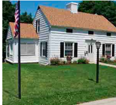
Le Moyne Veterans Center

Hospice of CNY is working in collaboration with student veterans and staff at Le Moyne College to honor veterans who are now Hospice patients. Six new volunteers were trained at Le Moyne to present veteran patients with certificates and pins to acknowledge and thank them for their service and the many sacrifices they have made.