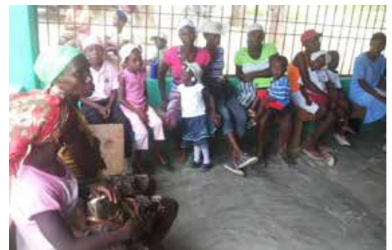
Full waiting room at the clinic